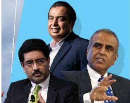
Industry and government to collaborate to find new ways for ease of doing business