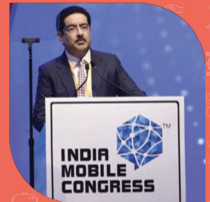
Mr. Kumar Mangalam Birla Chairman, Aditya Birla Group

“India's digital ecosystem stands on the brink of unprecedented growth”