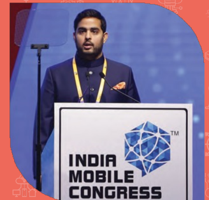
Mr. Akash M Ambani Chairman, Reliance Jio Infocomm Ltd (RJIL)

“We pledge to unify India through initiatives like GST, digital connectivity, and the Statue of Unity and create a “Digital Statue of Unity” - a virtual replica that will inspire and unite 1.4 billion Indians towards realizing India's dreams”.